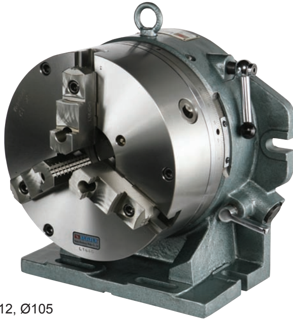
CC-12, Ø105 BIG THROUGH HOLE DESIGN